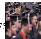
Storer Scholarship winners announced