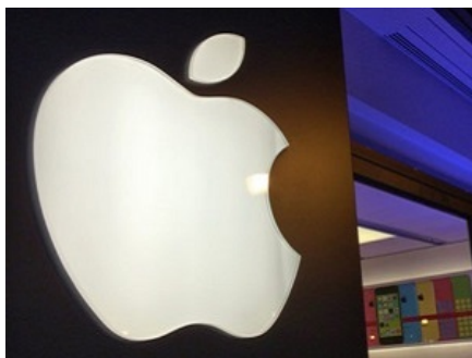
1 small company is the key to Apple's latest device, and its stock has wealth-changing potential.