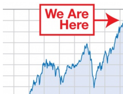
Largest Wave Ever In US Stock Market. Over 50? Invested? You're At Risk... See Full Story Here.