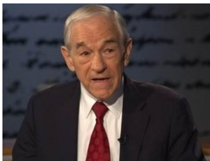
22-Year Congressman Explains How And When A Dollar Collapse Could Happen— And How To Prepare