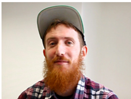
How I learned 9 languages and am learning even more, and how you could too.