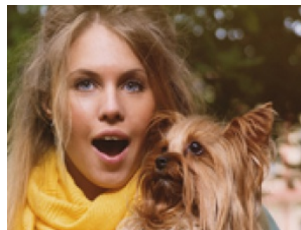
1 UNKNOWN Secret To Eliminate 15 Years Of Mortgage Payments